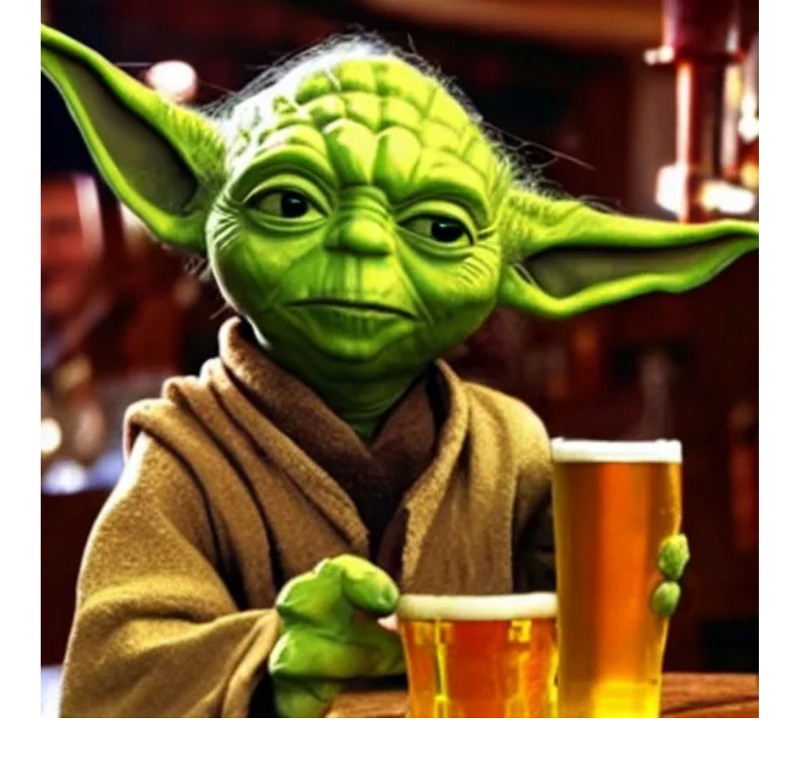
Ready to Teach You Are